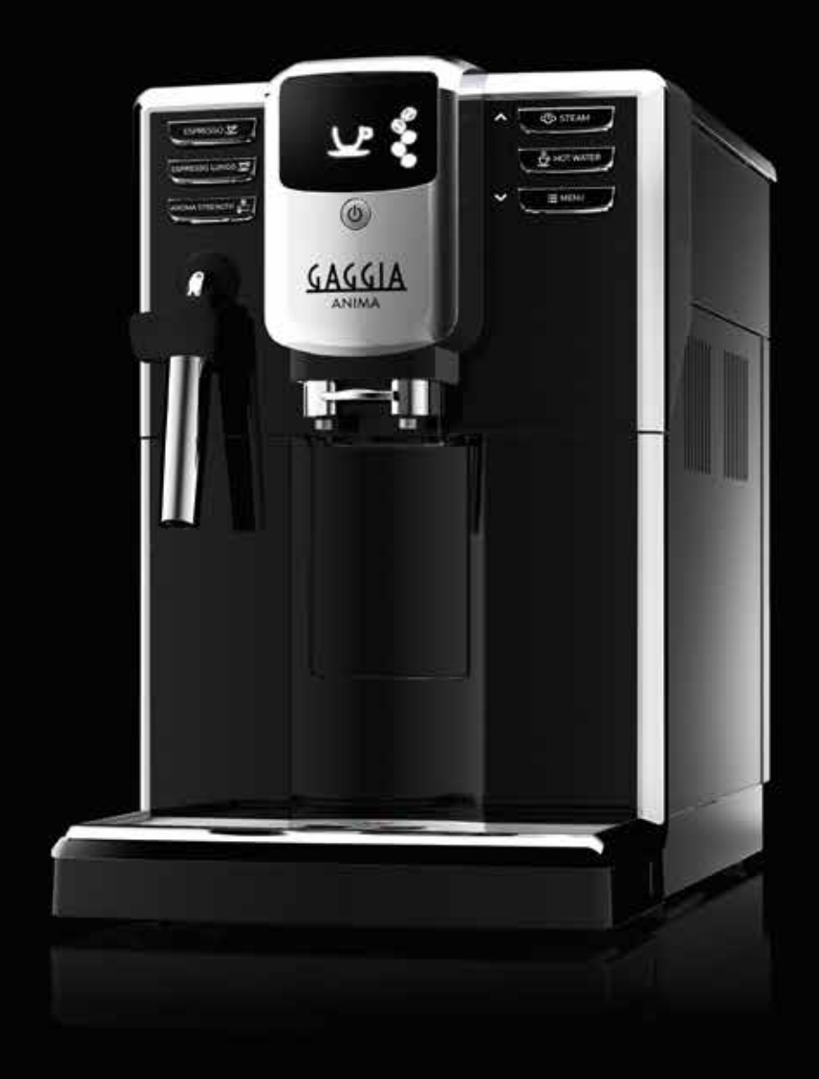
Black is back.

The most elegant color ever enriched by chromed metal painted details.